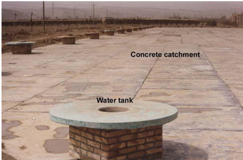
Water tank in Zambia.