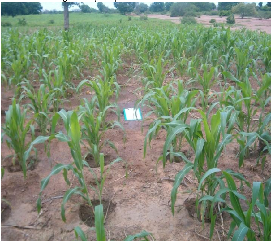
Sorghum in Zai pits.