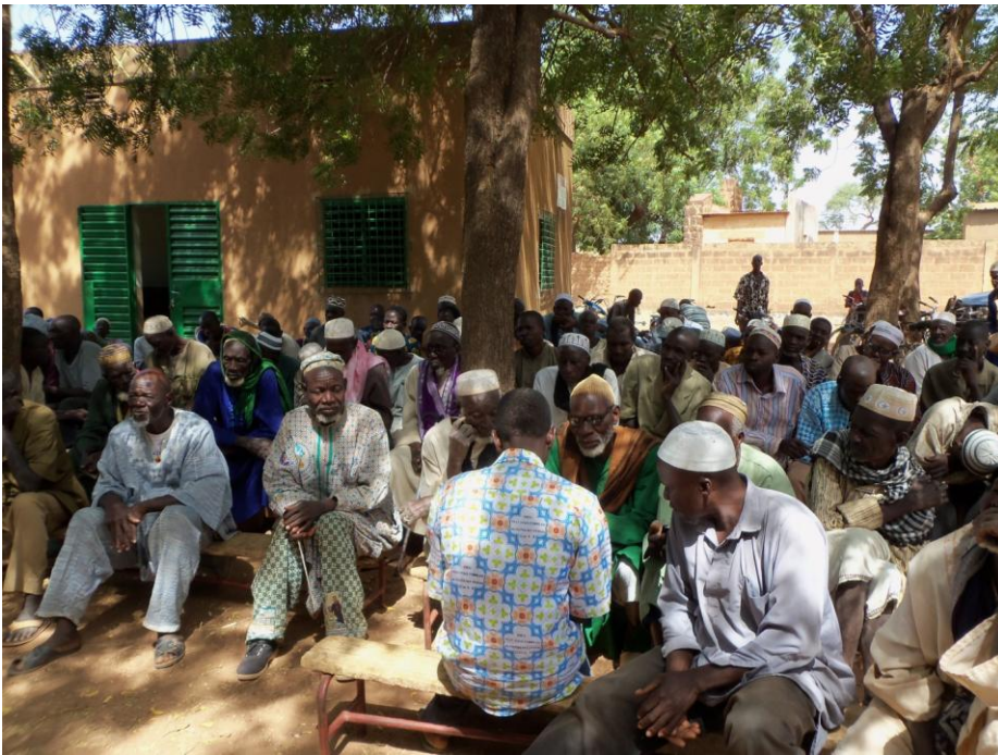
Figure1 : Lancement des activités du projet Wahara

Enfin, des petits groupes de travaux entre les représentants des sites et communes de chaque site ont été organisés et présenté les technologies et stratégies choisies et les raisons de leurs choix. Ils ont fourni à chaque fois qu'il était possible des informations sur les lieux où appliquer ces technologies et les porteurs des expérimentations individuelles et collectives.