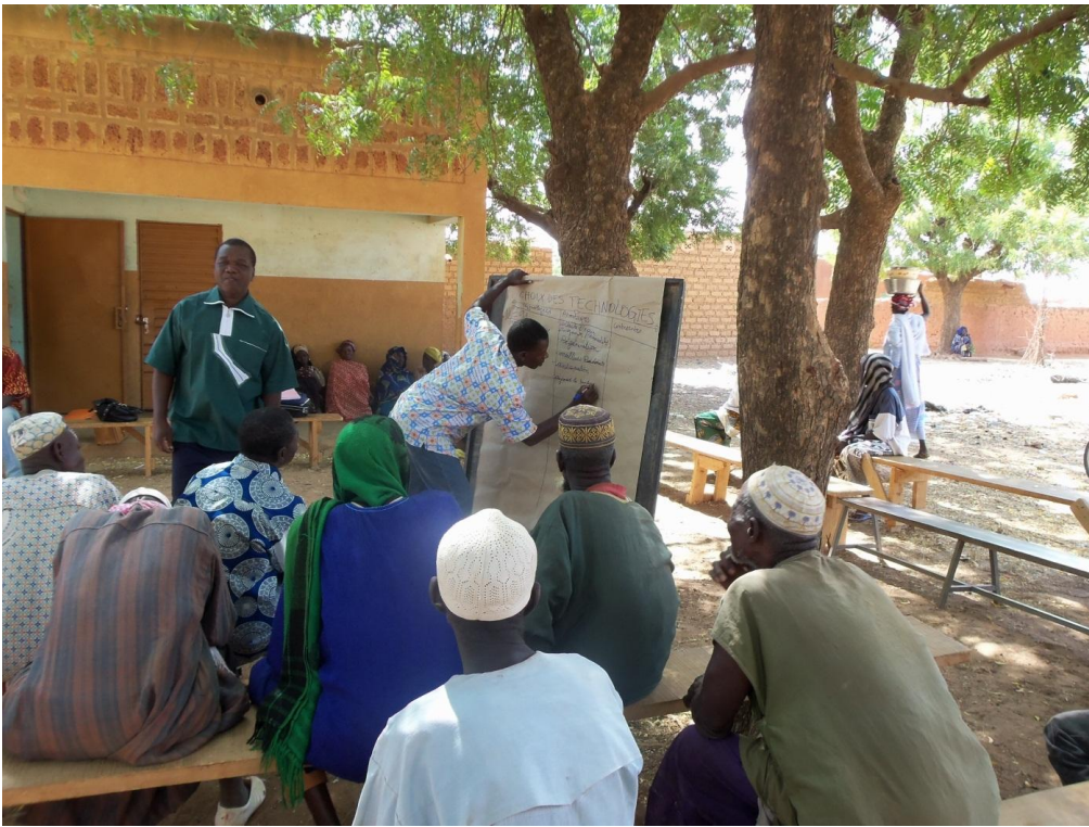
Figure 2 : Restitution des travaux en public par chaque groupe