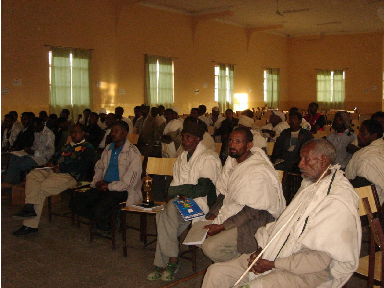
Plate ....: WAHARA project stakeholder workshop, Jan. 28, 2012, Wukro, Ethiopia.

The presentations were then followed by general discussion. The most important issues forwarded by the participants of the stakeholder workshop are presented below.