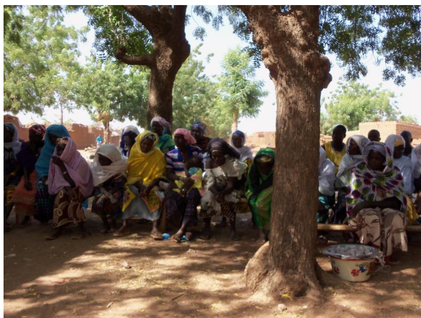
Figure 3: Participation importante des femmes

Pour tenir compte du genre, il a été proposé que les activités proposées intègrent la culture des légumineuses dans des champs avec cordons pierreux. L'arachide et le niébé sont particulièrement recherchés par les femmes.