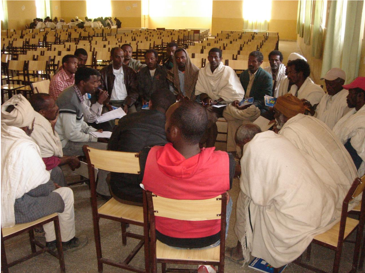
Plate .....: WAHARA project stakeholder workshop (group discussion), Jan. 28, 2012, Wukro, Ethiopia.